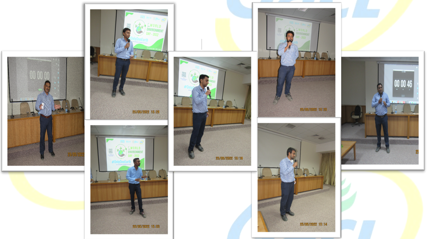
Participants delivering talk during competition

“SPOT TALK” Competition was held by Environment Dept. in which the participants had to pick a chit containing a topic on which they presented their original and unorganised ideas in three minutes.