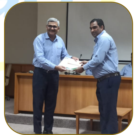
Felicitation to winners