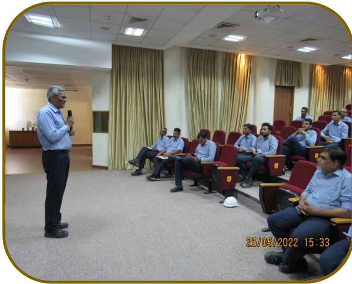
Insightful address by AGM (S,E&F)

Winners of SPOT TALK competition were felicitated by the executives and were awarded with cash prize and certificates too.